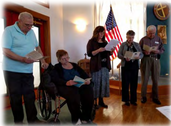
They celebrated with a reception after the service.

We celebrate with the Pleasant Valley Presbyterian Church in Brodheadsville who received four new members on Sunday, January 29, 2017.