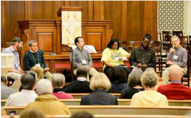
Open panel discussion at New York Avenue Presbyterian Church during 2016 CPJ Day.

https://www.presbyterianmission.org/story/registration-open-compassion-peace-justice-training-day/